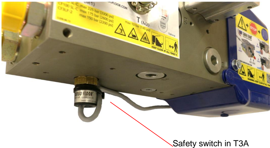
Safety switch in T3A

Screw the complete safety switch, by hand, as far as possible into opening T3A of the control valve. Then fasten it, at max 22 Nm, with fork spanner 27 mm.